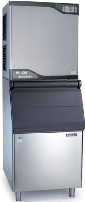
MV 1006 with SB530 (sold separately)